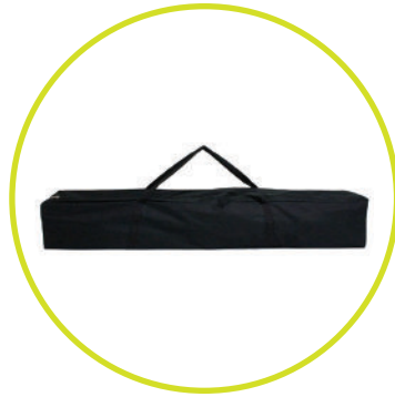
QTY 1: Black Nylon Carry Bag