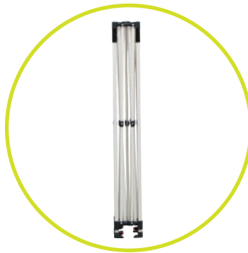
QTY 1: Frame w/ Pre-Installed Graphic

• 7 3/4" L x 7 3/4" W x 61 5/8" H (Collapse Frame)