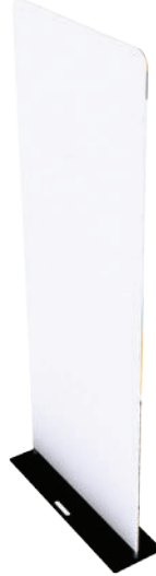
Single-Sided Back View