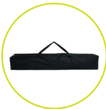
QTY 1: Black Nylon Carry Bag