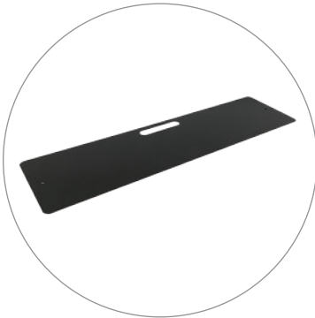
QTY 1: Steel Base