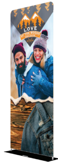
Double-Sided Back View