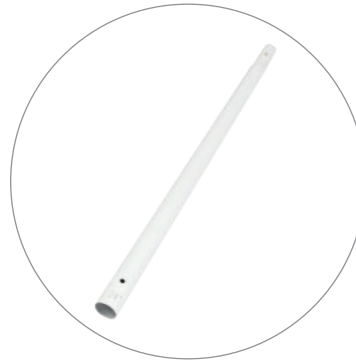
QTY 2: 24" Tubes