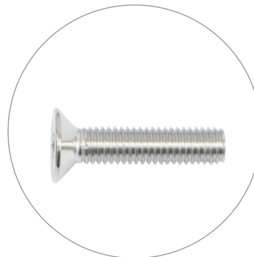
QTY 2: Steel Base Screws