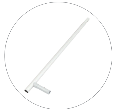
QTY 2: 32" Bottom Tubes