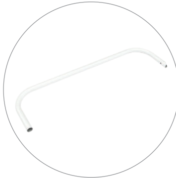
QTY 1: 36" Top Tube