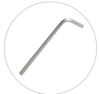
QTY 1: 5 mm Allen Key