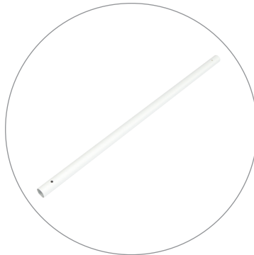
QTY 1: Horizontal Bottom Tube