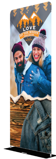
Double-Sided Back View