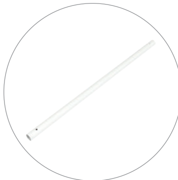
QTY 1: Horizontal Bottom Tube