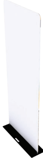
Single-Sided Back View