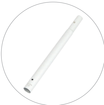
QTY 4: 12" Tubes